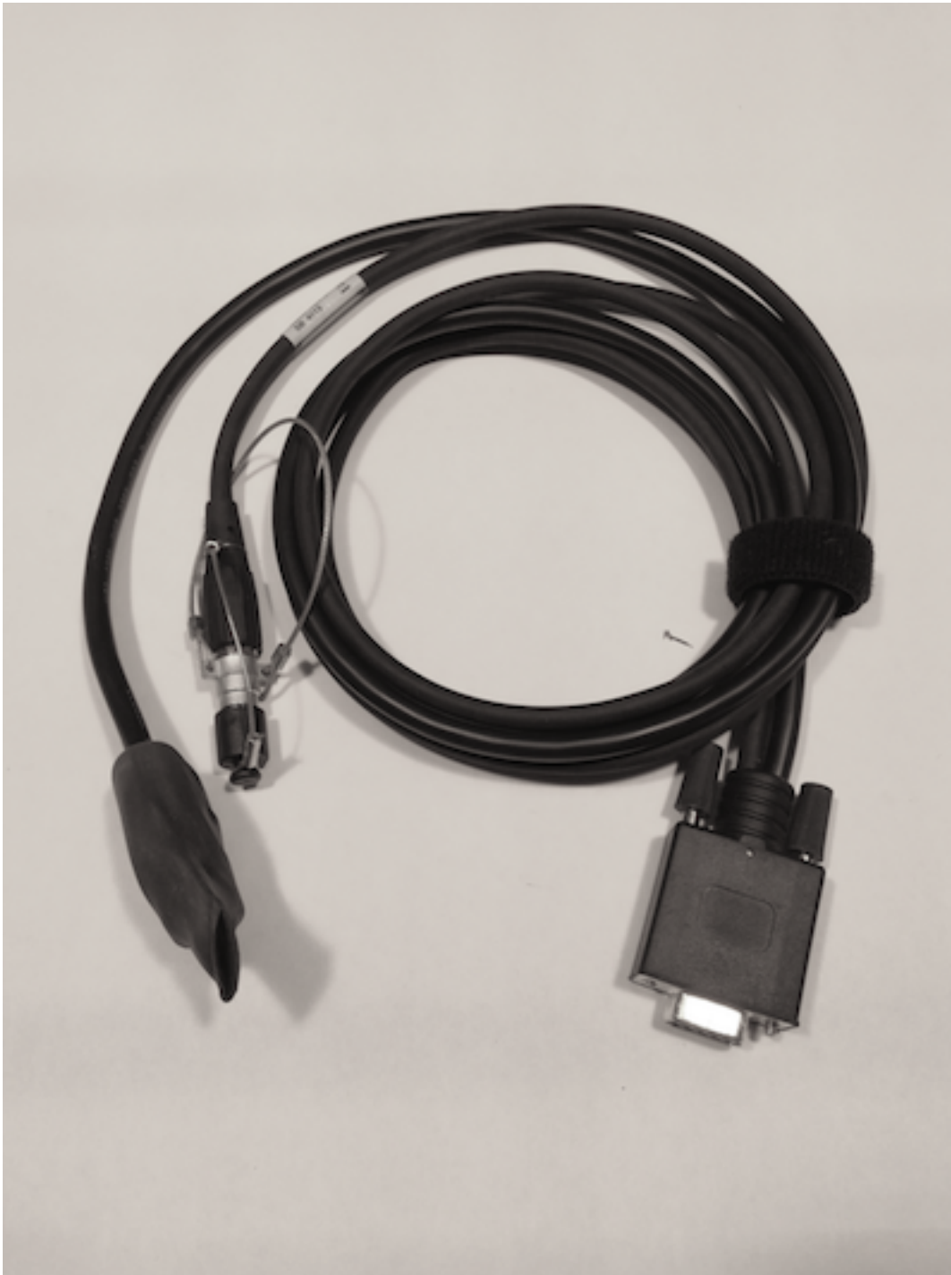
DC power cable - Used to connect the receiver to the Genasun charge controller or the AC power adaptor. Also provides a DB-9 serial connection to the receiver.