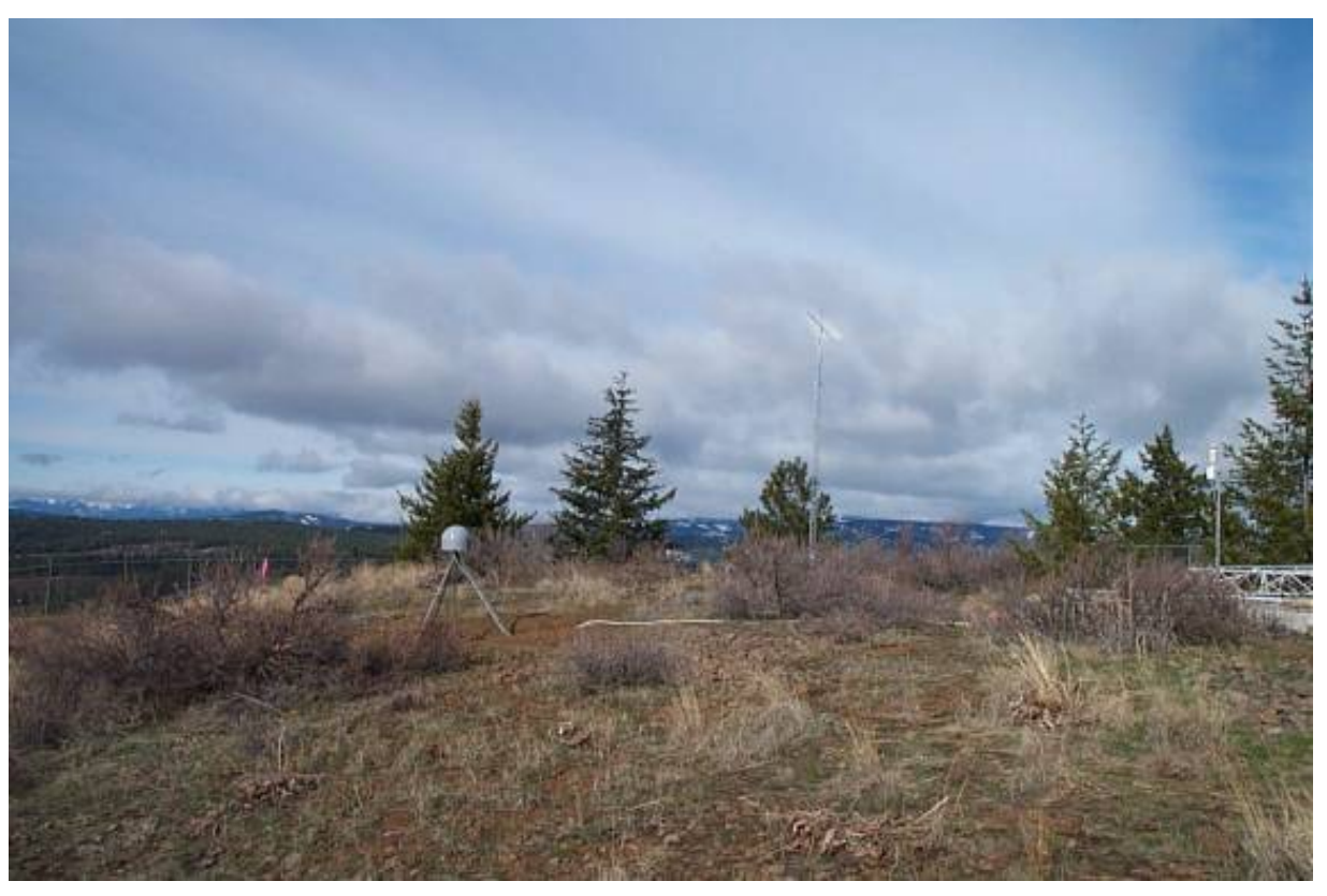
GPS station SC00 looking East. Note antenna mast for microwave link to the right of the GPS Antenna. The MET pack is at the far right of the photo.

Manastash Ridge Observatory (sc00) site is located east of Ellensburg, Washington on Manastash Ridge. This site was the first geodetic quality SuomiNet site. A microwave communications link between the Observatory and CWU provides real-time data flow.