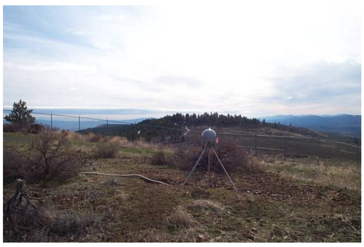
GPS station looking West.