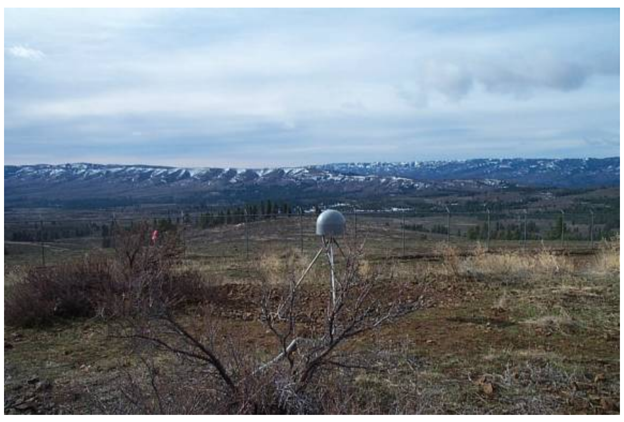
GPS station looking North.