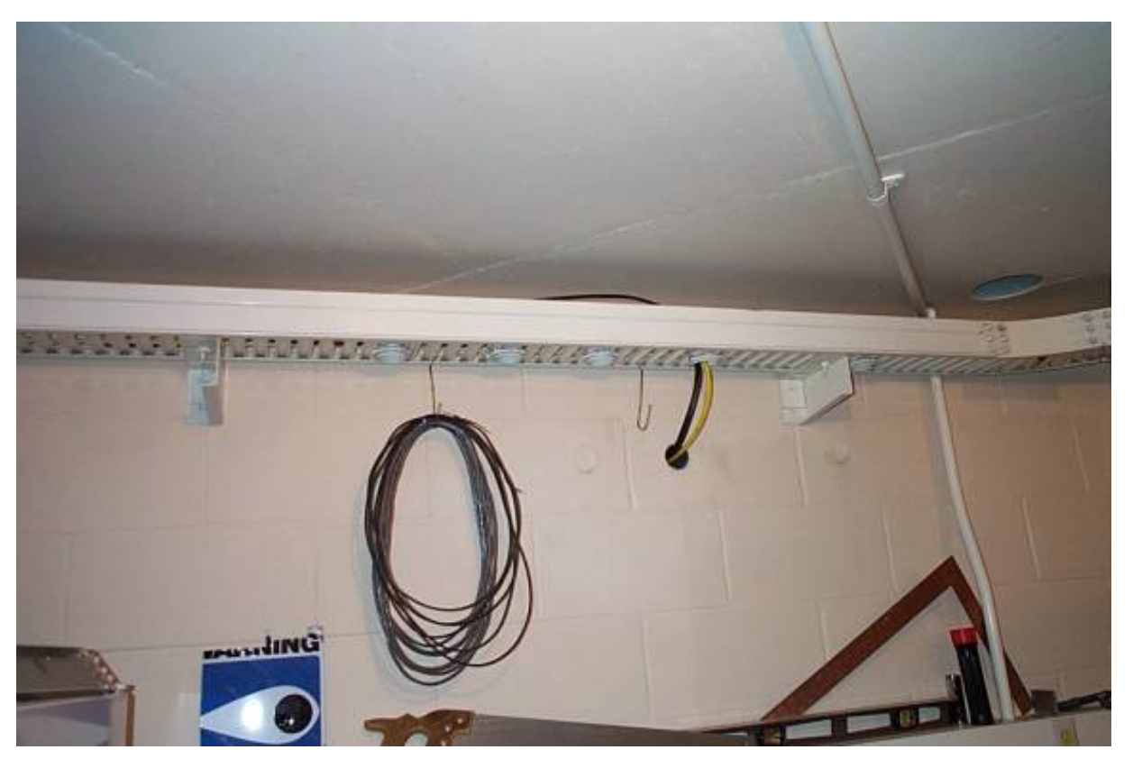
Area where the MET and antenna cables enter the observatory.

Online URL: https://kb.unavco.org/article/suominet-central-washington-university-site-sc00-566.html