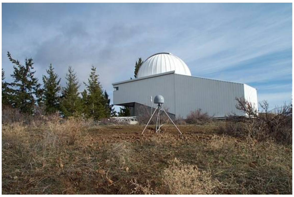
GPS station looking North. The UW observatory is in the background. MET sensor can Be seen directly behind the GPS antenna.