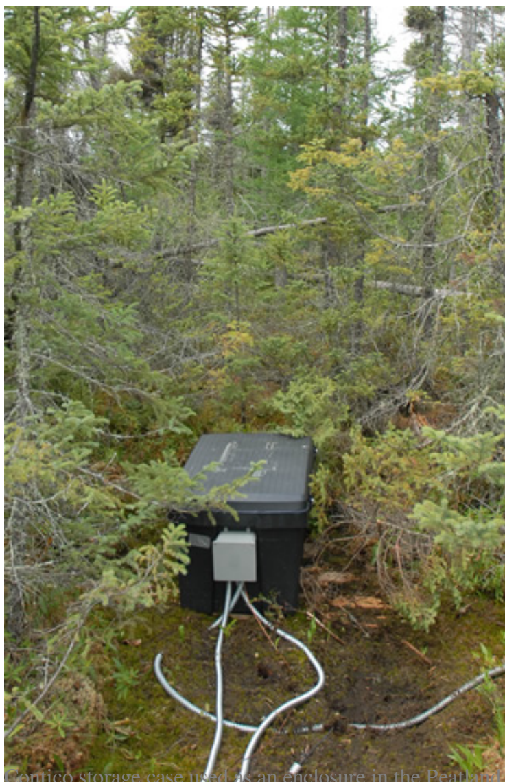
Contico storage case used as an enclosure in the Peatland Bogs network, Minnesota.

Back to Permanent GNSS Station Enclosures summary page