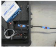
Then Connect the Solar Panel With The Pass-Through