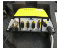
Finally Connect the Power Cable to the Receiver