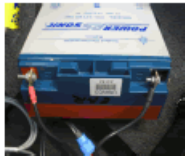
First Connect Battery. Ensure + Red, - Black!!!