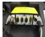
Finally Connect the Power Cable to the Receiver