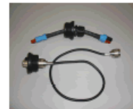
**Solar (top) and Antenna (bottom) Pass-Throughs**