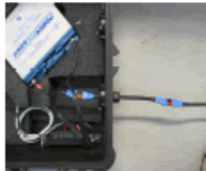
Then Connect the Solar Panel With The Pass-Through