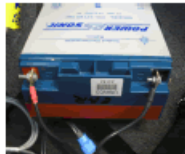
First Connect Battery. Ensure + Red, - Black!!!