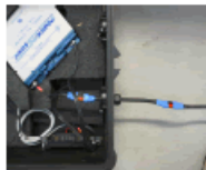
Then Connect the Solar Panel With The Pass-Through