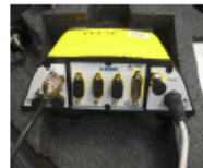
Finally Connect the Power Cable to the Receiver