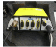
Finally Connect the Power Cable to the Receiver