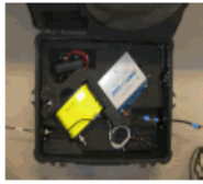
Complete System Setup