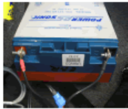
First Connect Battery. Ensure + Red, - Black!!!