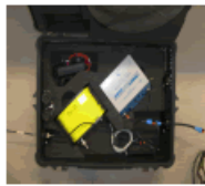
Complete System Setup