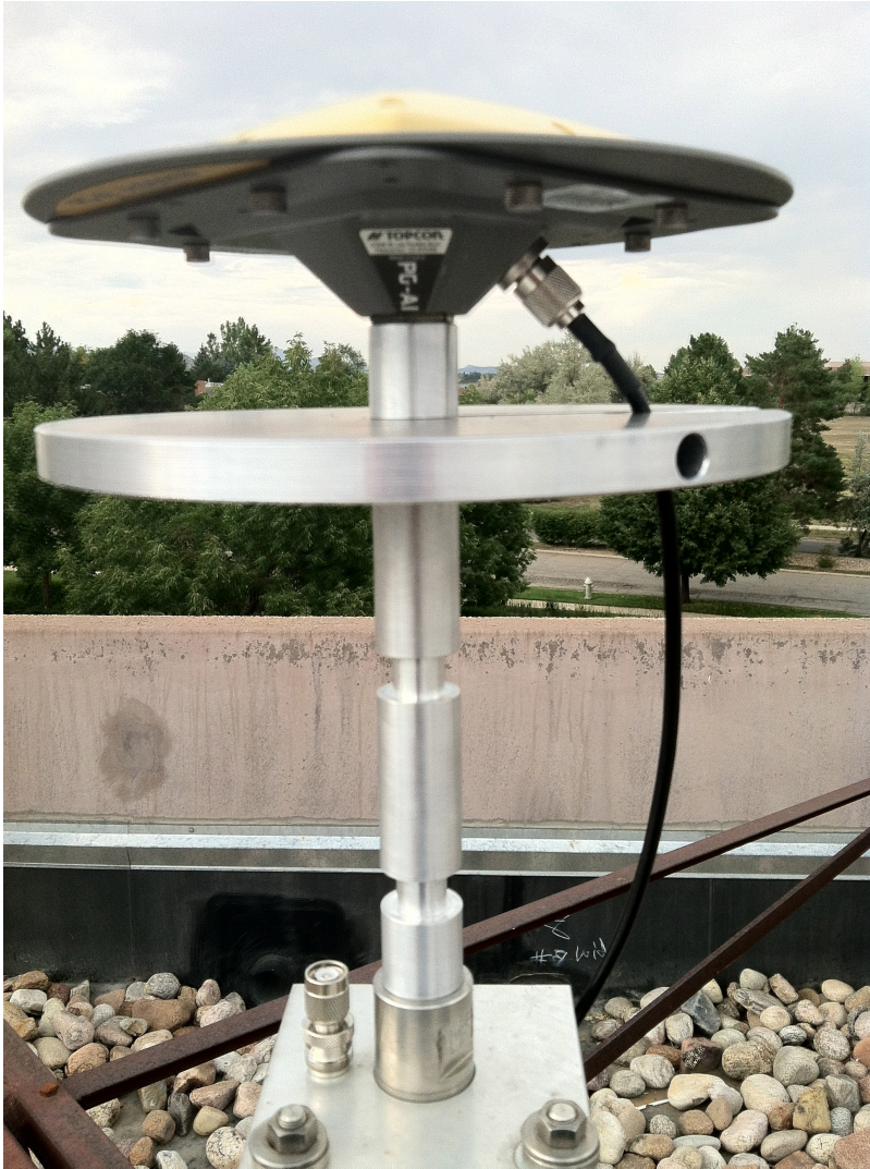
Figure 2. The antenna testing mount with TPSPG_A1+GP type antenna in place (looking north). The testing mount consists of an aluminum standoff with three evenly spaced notches that allow for a aluminum disk to be precisely fixed at different heights below the antenna. The disk can be moved without displacing the antenna.

For the following tabulated results we used only the two uppermost notches on our test standoff. Approximately a week of observations were collected with the plate in the uppermost position. After a week, the plate was moved from the uppermost notch to the middle notch and an additional week of observations were collected. For each tested antenna type, the antenna was not physically displaced during the experiment. For the duration of the experiment the same reference antenna was collocated with the test antenna to create a short baseline for post-processing.