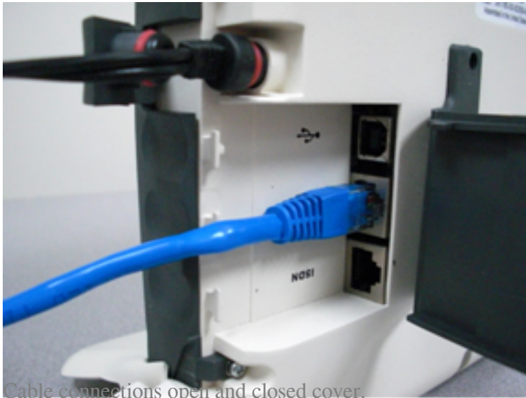
Cable connections open and closed cover.