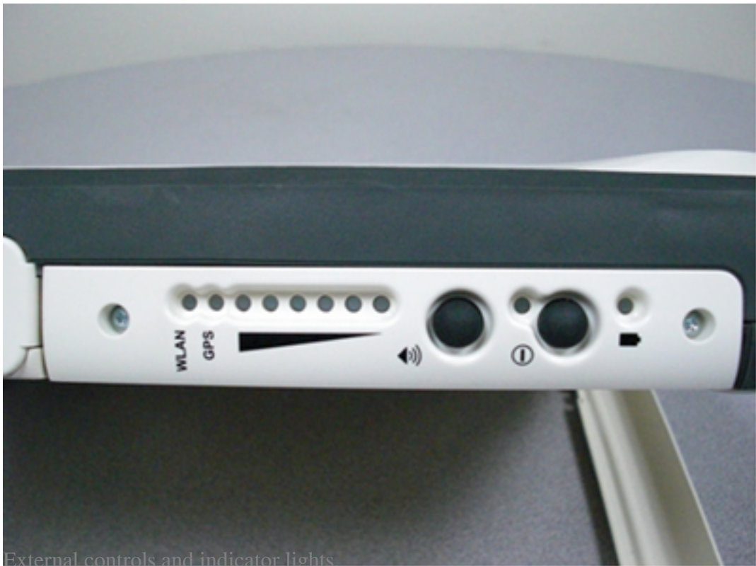
External controls and indicator lights.