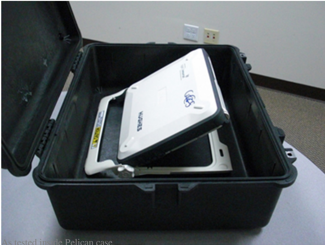
As tested inside Pelican case.