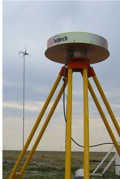
GPS Antenna w/ AIR 403