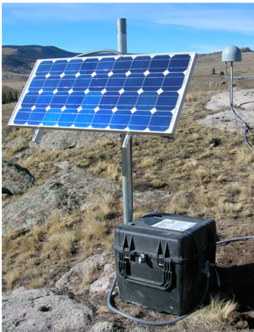
Pelican case and solar panel as used in the Rock Creek Assembly, Colorado and New Mexico.

Back to Permanent GNSS Station Enclosures summary page