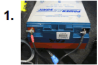
1. First Connect Battery. Ensure + Red, - Black!!!