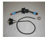
**Solar (top) and Antenna (bottom) Pass-Throughs**