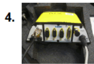
4. Finally Connect the Power Cable to the Receiver