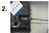
2. Then Connect the Solar Panel With The Pass-Through