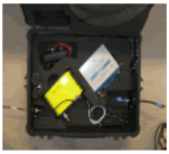
Complete System Setup