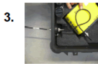
3. Next Connect the Antenna Cable With the Pass-Through